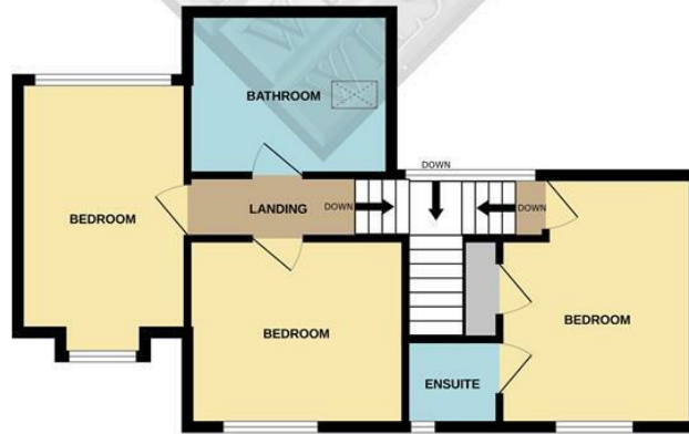
TOTAL FLOOR AREA : 1066 sq.ft. (99.1 sq.m.) approx.

Whilst every attempt has been made to ensure the accuracy of the floorplan contained here, measurements of doors, windows, rooms and any other items are approximate and no responsibility is taken for any error, omission or mis-statement. This plan is for illustrative purposes only and should be used as such by any prospective purchaser. The services, systems and appliances shown have not been tested and no guarantee as to their operability or efficiency can be given. Made with Metropix ©2024.